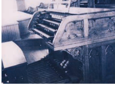
Karn-Warren console (1933) Saint-François-d'Assise church Wellington at Fairmont Street, Ottawa